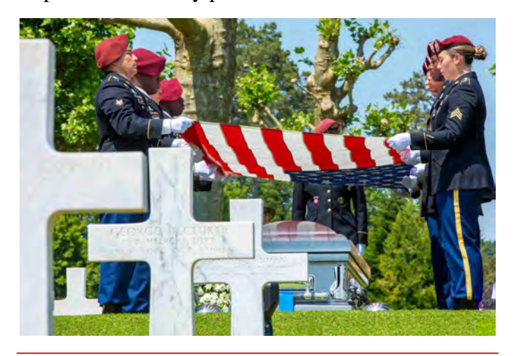
SBP for Reservists and Guard Members

You may also terminate an insurable interest election at any time. If you terminate, you will never be able to re-enroll regardless of any changes in your dependency status, and you will not receive a refund of premiums already paid.