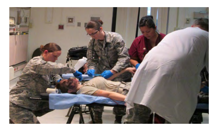
Chapter 2: Your Medical Care

When you become an outpatient, you may be able to designate one individual (either an immediate family or designated person) to be your Non-Medical Attendant (NMA). This individual, recommended by a medical authority, and may remain with you during your recovery. Contact your local MTF or regional Service administrative section with any questions about the NMA authorization.